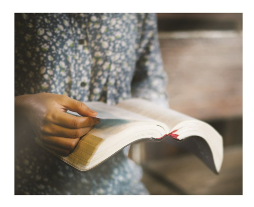
Excerpts from the Lectionary for Mass ©2001, 1998, 1970 CCD. The English translation of Psalm Responses from Lectionary for Mass © 1969, 1981, 1997, International Commission on English in the Liturgy Corporation. All rights reserved.

Wis 7:7-11/Ps 90:12-13, 14-15, 16-17 (14)/ Heb 4:12-13/Mk 10:17-30 or 10:17-27