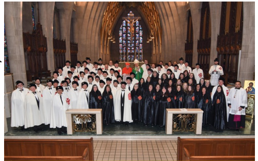
Newly invested Knights and Dames pose in St. Joseph the Workman Cathedral with Archbishop ListECKI, KC*HS and Raymond Leo Cardinal Burke, KGCHS.

The Equestrian Order of the Holy Sepulchre of Jerusalem is a Pontifical Order of Chivalry under the protection of the Holy See. Its origins can be traced back to the year 1099 and the First Crusade. Members make a lifetime commitment to live a life of the Order’s spirituality and make a commitment to the Order’s mission of service and support for the Christians in the Holy Land. Today the Order numbers over 30,000 members worldwide. The North Central Lieutenancy covers the states of Illinois, Indiana, Kentucky, Michigan, Ohio and Wisconsin.