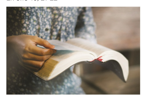
Excerpts from the Lectionary for Mass ©2001, 1998, 1970 CCD. The English translation of Psalm Responses from Lectionary for Mass © 1969, 1981, 1997, International Commission on English in the Liturgy Corporation. All rights reserved.

Is 40:1-5, 9-11/Ps 104:1b-2, 3-4, 24-25, 27-28, 29-30 (1)/Ti 2:11-14; 3:4-7/ Lk 3:15-16. 21-22