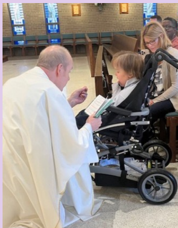
Photo taken at Holy Trinity.